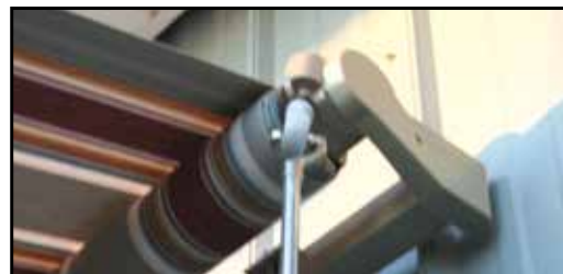
Standard unit without hood

Optional drop valance available up to 24' widths and projection up to 11' 9".