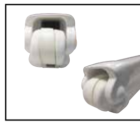
New belt arms for lasting performance