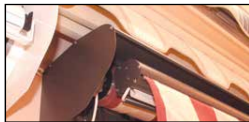
Standard unit with optional drop valance front rail style.