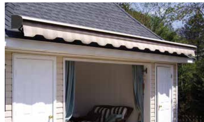
Roof mount - fully retracted

Superb durability and maintenance-free operation, Elite Plus offers the finest component features available in the industry.